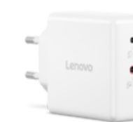
Lenovo Dual USB-C 65W GaN Charger