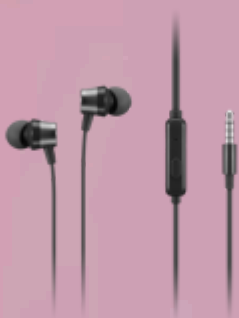
Lenovo Analog In-Ear Headphones Gen II Bulk Package (20pcs) 4XD1T54899